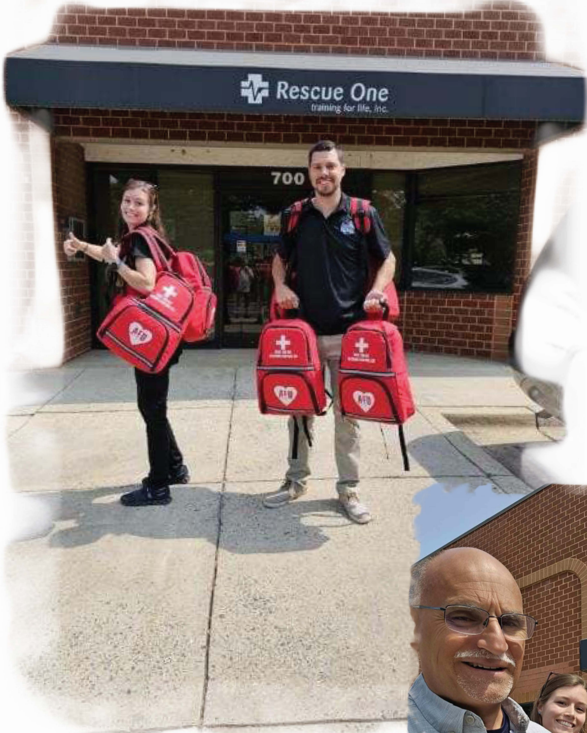
Above and Right: AED and First-Aid kits being picked up from Rescue One for delivery to the Seab Pleasant Police Department.