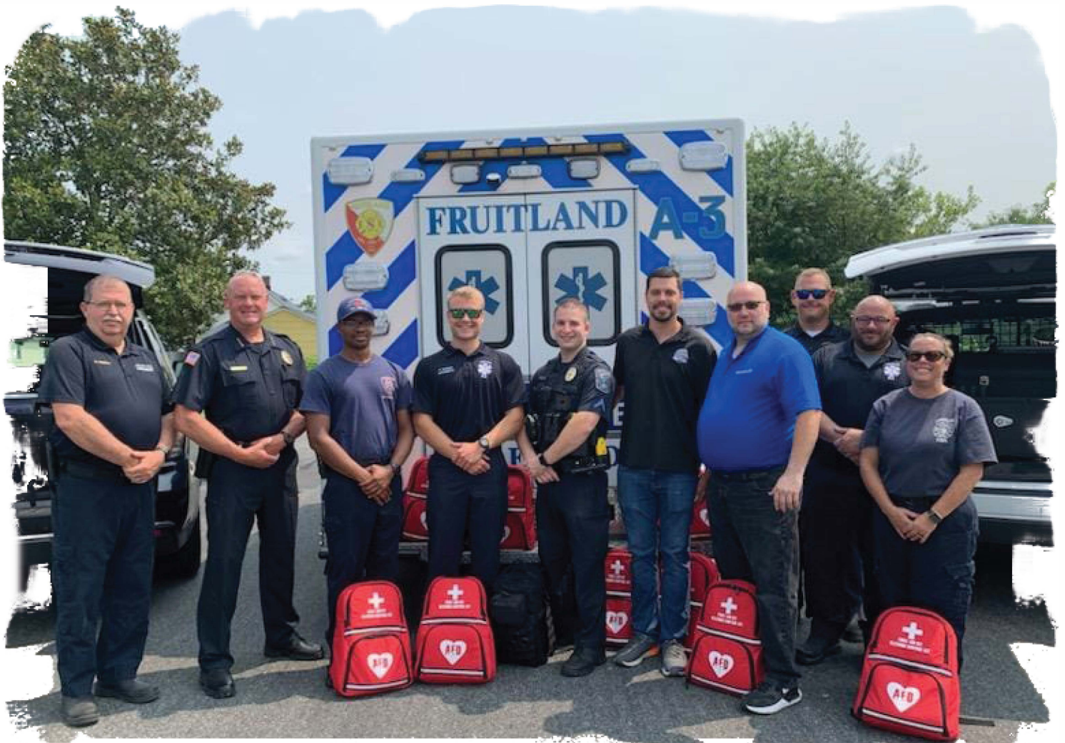
AED's, First Aid Kits, Bleeding Control Kits, and CPR Equipment to the Fruitland Police Department.