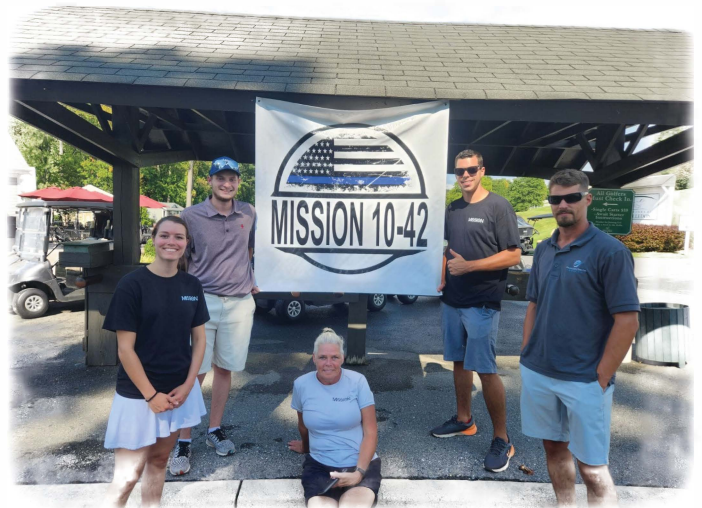
First Annual Golf Tournament