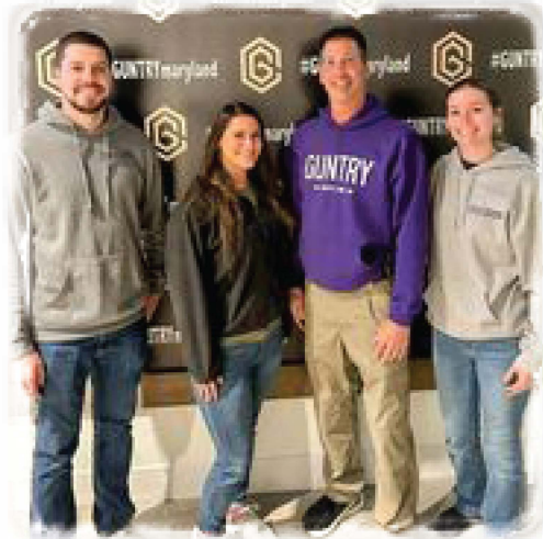
MISSION 10-42 members with Guntry