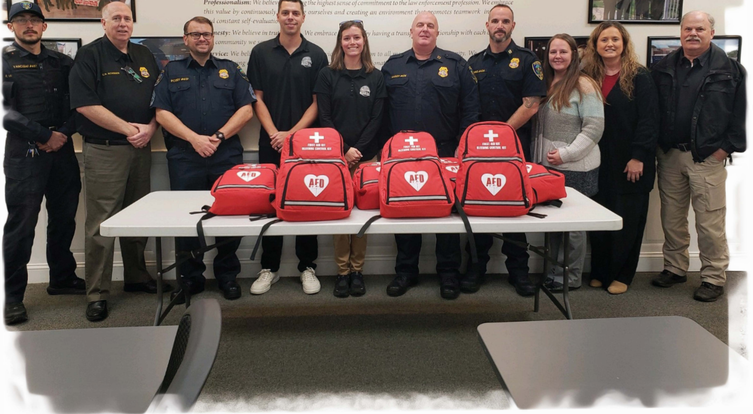
Above: The La Plata Police Department poses with AED's and life saving equipment donated by MISSION 10-42 . Below: AED and First-Aid kits on their way to be delivered to the La Plata Police Department.

Service: We believe in providing the best service to all members of the community. We embrace this value by being responsive, efficient, and courteous in all our interactions.