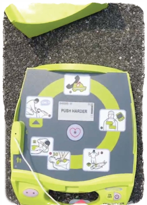
Above and right photos: Members of the Fruitland Police Department demonstrate life saving AED equipment on a dummy for local news coverage of the MISSION 10-42 donation of life saving equipment.