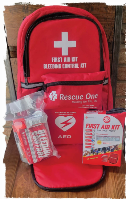
AED's, First Aid Kits, Bleeding Control Kits, and CPR Equipment