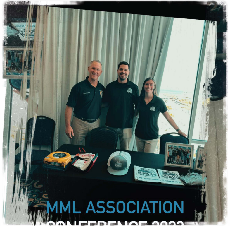
MMLPEA - Maryland Municipal League Police Executive Association