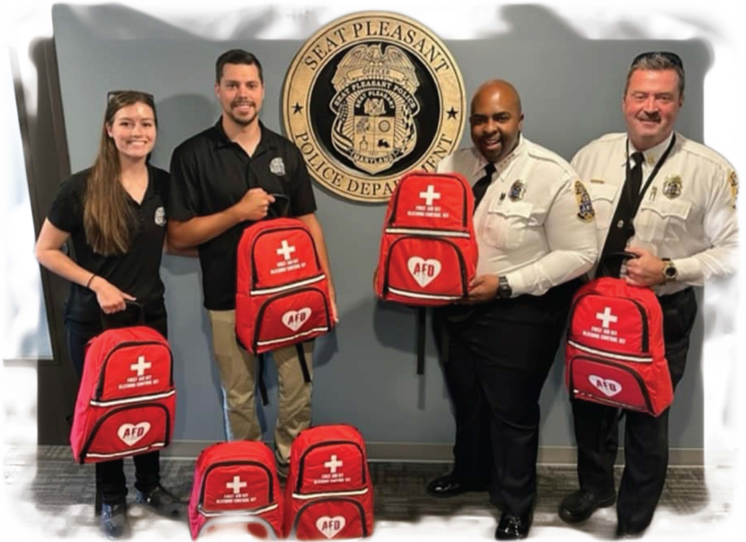
Above: The Seat Pleasant Police Department poses with AED's and life saving equipment donated by MISSION 10-42