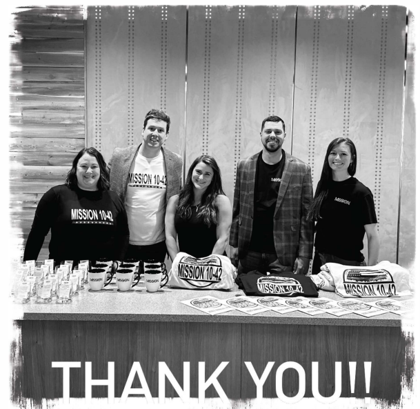
MISSION 10-42 members hosting 1st Annual Bourbon and Cigars at Guntry