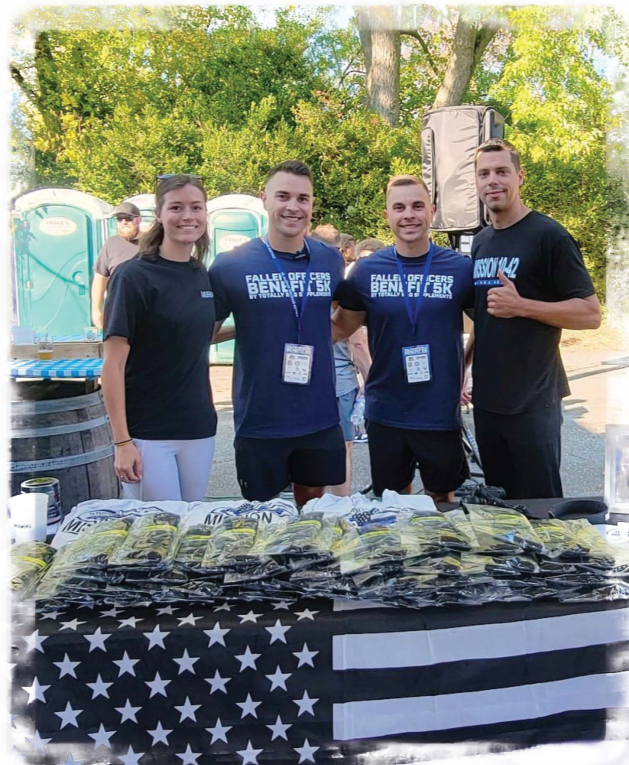
Fundraising event with Totally Rad Supplements to honor fallen officers