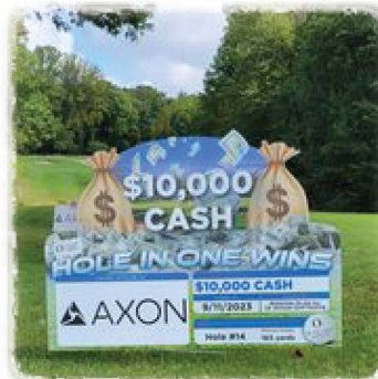
AXON Golf Sponsor Signage