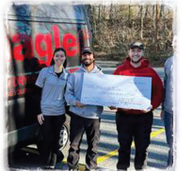
Donation from Nagler Duct & Dryer Vent Cleaning LLC