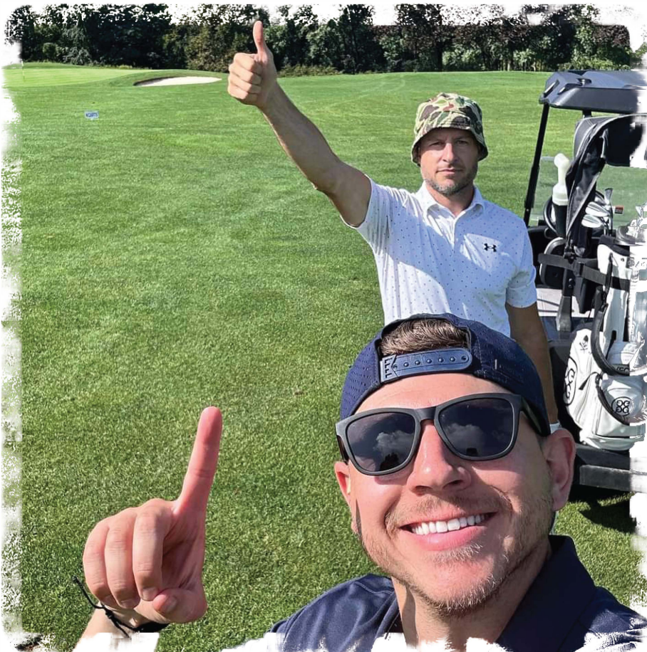
First Annual Golf Tournament Participants.