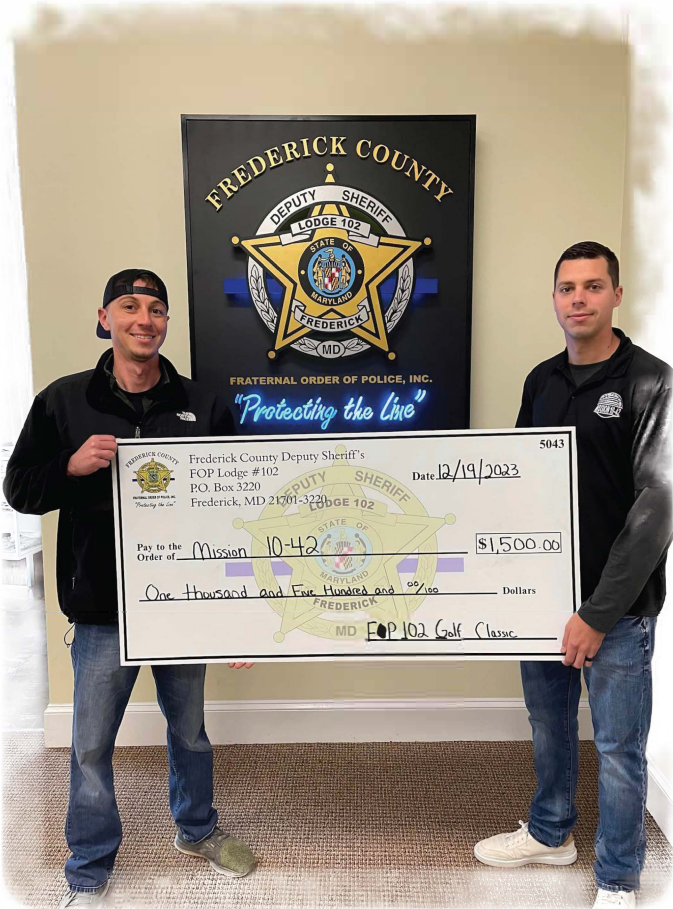
Donation from Fraternal Order of Police (FOP) from Frederick County Deputy Sheriffs